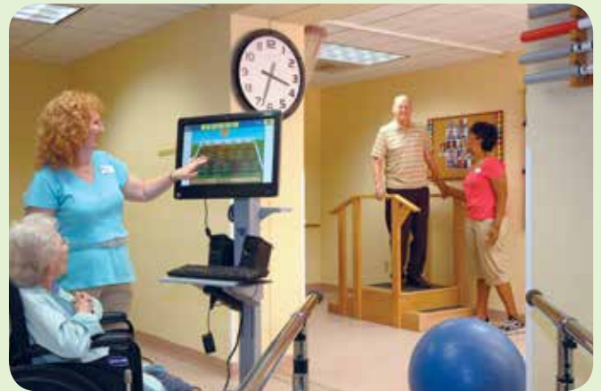
Residents focus on Touch Screen iN2L assistive technology, which enhances cognitive function, memory and lifelong learning; and physical therapy at Collingswood Manor.

A few examples include daily exercise group, nutritional health programs; physical, occupational and speech therapies; psychiatric and podiatry services; and educational in-services on topics like diabetes, cold and flu prevention; socialization; group activities; and many more.”